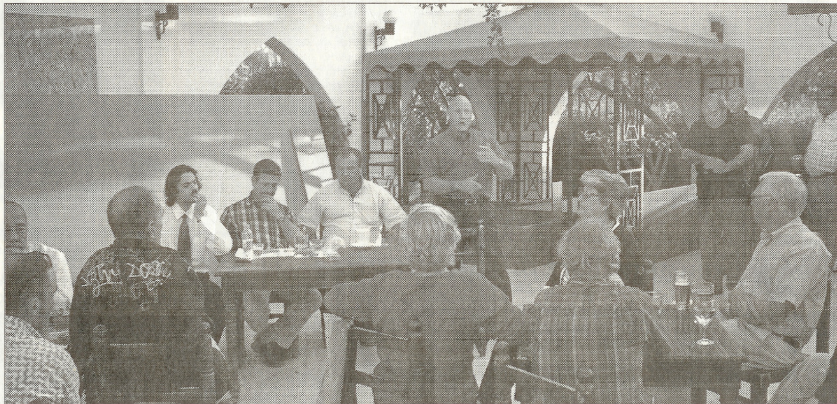
A large crowd of Aga Development home buyers met at Çatalköy's Fireman's Fez Restaurant to hear from the horses mouth.

A LARGE crowd of Aga Development home buyers met at Çatalköy's Fireman's Fez Restaurant to hear from the horses mouth the assuring words that the money they paid in stages to the Company will not be lost